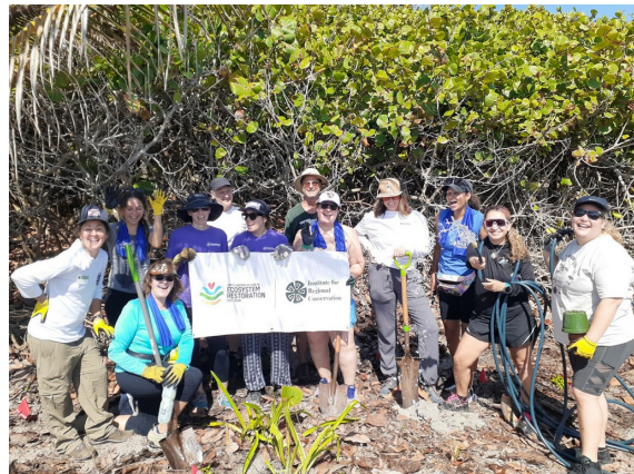
Volunteer Event on 4/12

We truly appreciate everyone who came out to all of our events to get their hands dirty and make their community a greener place. Your efforts are making a real difference in restoring this beautiful habitat and coastal ecosystem.