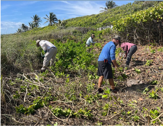
Volunteers removing invasive Beach naupaka, creating space for future plantings.