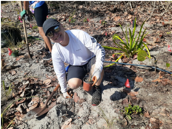
Volunteer installing Sea Oats

Thanks to funding and support from the City of Boca Raton, IRC was able to enhance over 23 different native coastal species such as the state threatened Inkberry ( Scaevola plumieri ), and state endangered Beach clustervine ( Jacquemontia reclinata ) and Sea-lavender ( Tournefortia gnaphalodes ).