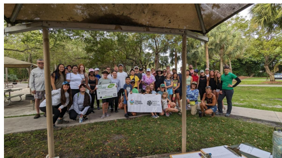
On 4/27, 40 volunteers came to our BioBlitz!

The last event of the month was a celebration with the City of Boca Raton for the City Nature Challenge. For this event participants took part in a guided nature tour and BioBlitz. Folks were educated about the importance of coastal conservation and had an opportunity to observe the different habitats while using the iNaturalist app to take part in citizen science.