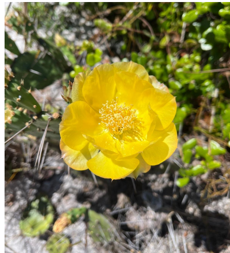
Pricklypear flower ( Opuntia mescantha )

IRC has an E-Trade account. Please contact us about giving gifts of stock.