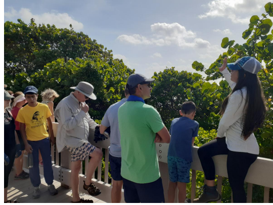
Picture to the left: Participants learned about coastal conservation education and added over 50 observations on to iNaturalist.